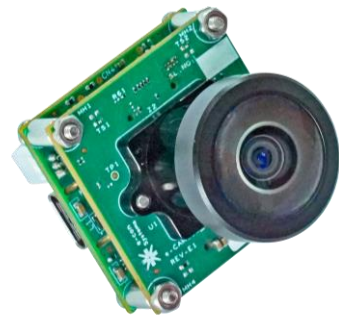
Figure 2: See3CAM_CU31 HDR Low-Light USB Camera (without Enclosure)