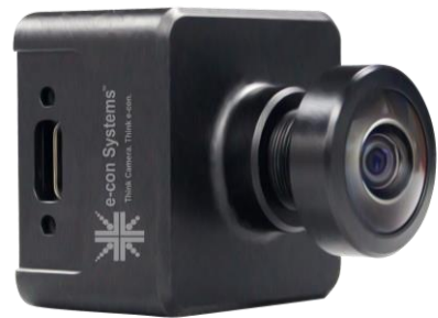
Figure 1: See3CAM_CU31 HDR Low-Light USB Camera (with Enclosure)