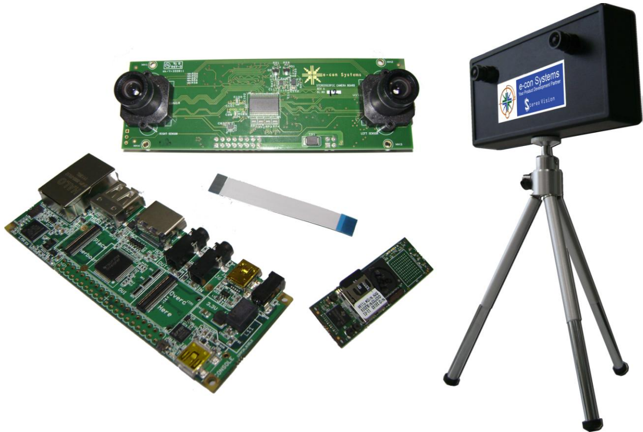
Figure 1 - Capella – Stereo Vision Camera Reference Design