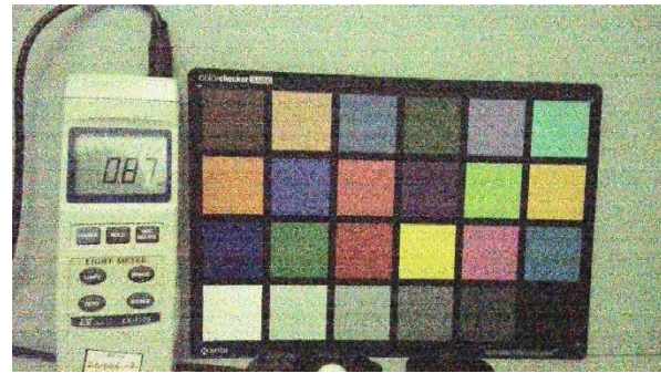
Figure 3: e-CAM82_USB Camera