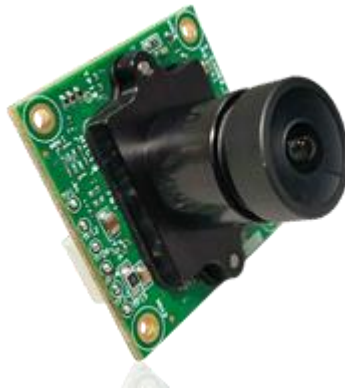
Figure:1 e-CAM82_USB - 4K USB Camera