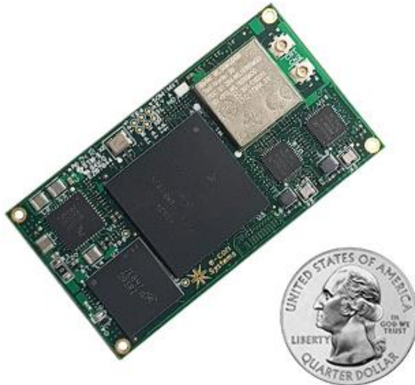
Fig 1 – eSOMiMX7 – i.MX7 System-On-Module

eSOMiMX7 is a ready to use System-On-Module using Solo / Dual core ARM Cortex™ A7 @ 1GHz along with dedicated real time ARM® Cortex™ - M4 MCU . It encompasses eMMC Flash whose capacity ranges from 4GB to 64GB, LPDDR3 with capacity as high as 2GB. eSOMiMX7 is a small form factor module providing all possible connecting options for Industrial and commercial products. eSOMiMX7 is an ultra-low power system on module which consumes only 3mA current during the deep sleep mode. eSOMiMX7 System-On-Module is available with latest Linux Kernel version v4.9.11, latest Yocto rootfs version 2.2 and Free RTOS version 8.