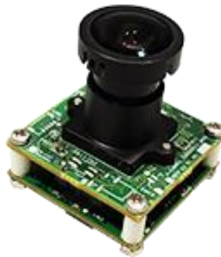
Fig-1: See3CAM_CU55 Low Noise USB 3.1 Gen 1 Camera

See3CAM_CU55 is ideal for customer applications where high resolution 5MP still images or Full HD video @ 60 fps are required. With S-mount lens holder, the See3CAM_CU55 is ideal for Smart Surveillance, Medical applications such as digital microscopy, Document Scanning cameras, Optical Character Recognition applications, smart parking lot management applications, high-resolution Microscopic/Magnification applications, Drones etc. The See3CAM_CU55 also highly suitable for high resolution video streaming, video conferencing and surveillance applications. Its humongous ultralow light sensitivity, excellent image quality with less noise will make it stand apart from other cameras.