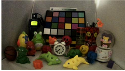
Light Source: Visible Light - 0.5lux