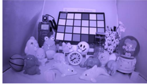
Light Source: Infrared