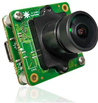
Fig:1 See3CAM_24CUG – side view

"Ever since we launched the MIPI interface version of the AR0234 based 2MP color global shutter camera for NVIDIA Jetson family for edge computing on Feb 3, 2021, we have witnessed the huge demand from our embedded vision customers. Taking forward this lead, e-con launches See3CAM_24CUG the first-in-the-world USB3.0 UVC color global shutter camera using AR0234 sensor", said Ashok Babu President of econ Systems, Inc. "With 120fps capability and zero motion artifacts, this camera is an ideal camera for autonomous mobile robots for marker reading, Visual SLAM, barcode scanning/object recognition for smart carts and smart checkouts, inventory management drones, Driver Management Solution etc", he added.