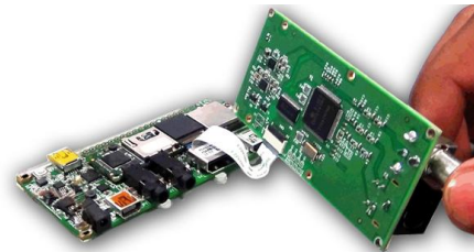
e-CAMNT_35x_GSTIX connected to Gumstix® Overo® COM

Customers who have bought Gumstix Overo COMs can directly plug in their analog cameras to the e-CAMNT_35x_GSTIX. The camera board directly plugs in to the 27 pin connector of the Gumstix Overo COMs. On the back-end side, the e-CAMNT_35x_GSTIX converts the analog signals to digital and generates a YUV output and this is further fed in to the OMAP35x/DM37x ISP interface based on whether the customer is using Gumstix Overo COM and Gumstix Overo Storm COMs. e-con Systems provides Linux drivers with full source code and sample applications for accessing the video frames, capture still images and record video.