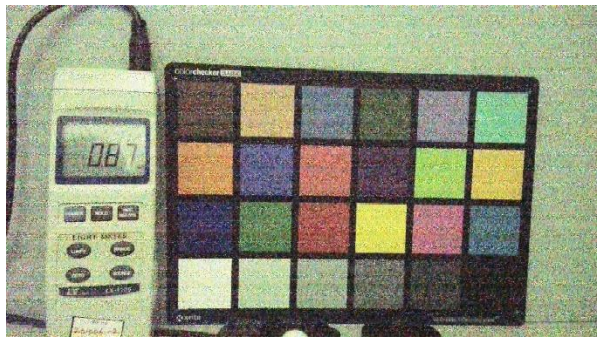
Figure 2: Normal Camera