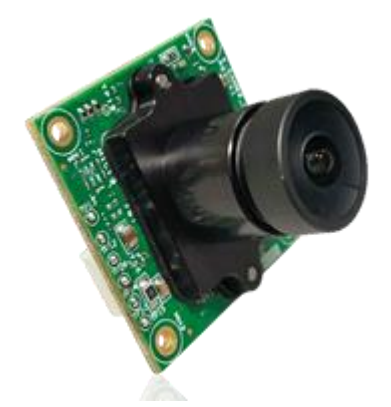
Figure:1 e-CAM82_USB - 4K USB Camera

" said Ashok Babu, President of econ Systems, Inc.