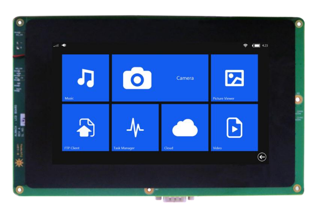
Figure 2: ALMACH – eSOM3730 Rapid development kit.

For more information, visit the eSOM3730 and the ALMACH web pages.